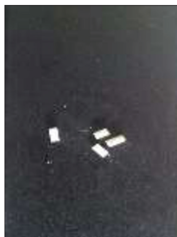
Figure 1: Mini-tablets of montelukast sodium

The average rating given by volunteers to all four formulations is recorded which is indicated the acceptability of natural waxes which are cheap in formulations which are more popular for their organoleptic properties [Table 11].