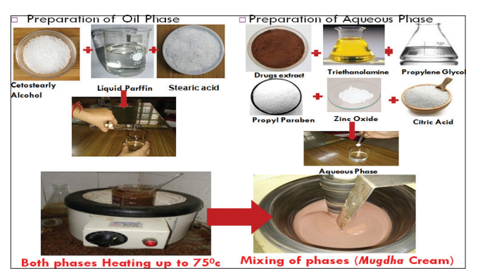
Figure 1: Preparation of cream

An exceptionally important parameter for emulsion products is their stability; however, the evaluation of emulsion stability is not trouble-free. Pharmaceutical emulsion stability is characterized by the absence of coalescence of dispersed phase, absence of creaming, breaking and retaining its physical characters such as elegance, odor, color, and appearance. The preparation of stable emulsion is critical for the efficient production of final dosage form. Here, various important parameters have been discussed that can affect emulsion stability, namely, stirring intensity, emulsifier concentration, water-oil ratio, mixing temperature, and mixing time. In cream preparation order of mixing the ingredients should be maintained, mixing should be done at maintained temperature, same temperature should be maintained during whole procedure (not exceed 75°C), mixing should be done with continuous stirring, and more mixing should be avoided as it may cause phase inversion.