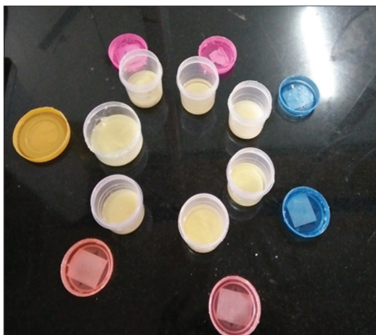
Figure 1: Different formulations of anti-dandruff shampoo