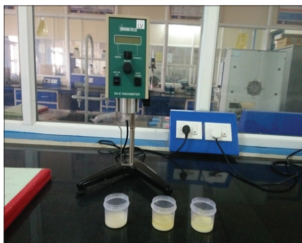
Figure 2: Brookfield viscometer