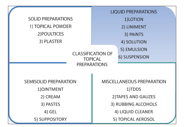
Figure 2: Classification of topical preparation<sup>[5]</sup>

which varies in thickness in different parts of the body. It is thickest on with elastic fibers. The skin forms a relatively waterproof layer that protects the deeper and more delicate structures. Blood vessels are distributed profusely beneath the skin. Especially important is a continuous venous plexus that is supplied by inflow of blood from the skin capillaries. In the most exposed areas of the body-the hands, feet, and ears blood are also supplied to the plexus directly from the small arteries through highly muscular arteriovenous anastomoses. A unique aspect of dermatological pharmacology is the direct accessibility of the skin as a target organ for diagnosis and treatment. The skin acts as a two-way barrier to prevent absorption or loss of water and electrolytes. There are three primary mechanisms of topical drug absorption: Transcellular, intercellular, and follicular. Most drugs pass through the torturous path around corneocytes and the lipid bilayer to viable layers of the skin. The next most common (and potentially under-recognized in the clinical setting) route of delivery is through the pilosebaceous route. The barrier resides in the outermost layer of the epidermis, the stratum corneum, as evidenced by approximately equal rates of penetration of chemicals through isolated stratum corneum or whole skin.