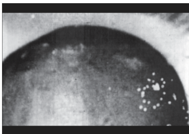
Figure 3: Microsphere 2