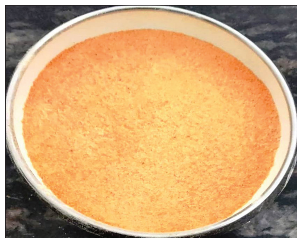
Figure 2: Powder of Masoor Daal ( Lens culinaris )