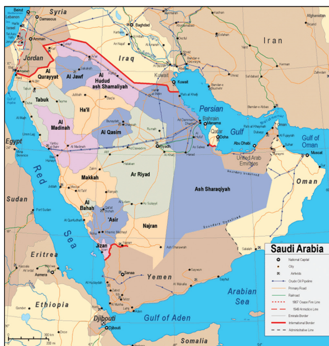
Figure 1: Map of Saudi Arabia

over 60. This data shows that the demand for health care is going to increase due to diseases caused by unhealthy lifestyles and non-communicable diseases (2020). [5] A report from a household survey by the General Authority for statistics conducted in 2018 reported a definite increase in non-communicable diseases and chronic diseases (2021). The World Health Organization (WHO) estimated that non-communicable diseases are responsible for the deaths of over 41 million people each year, equivalent to 71% of all deaths globally. Most of these deaths are caused by cardiovascular diseases, which kill 17.9 million people annually, followed by cancer (9.3 million), respiratory diseases (4.1 million), and diabetes (1.5 million). [6] National statistics retrieved from the Saudi Arabian government report the same statistics for common diseases that lead to death in the Kingdom. According to Tyrovolas et al. (2020), the main causes of death were reported to be ischemic heart disease, stroke, and road injuries. Depression was the leading cause of disability in females, and road injuries were the leading cause in males. High body mass index (BMI) has been reported to be a major risk factor for disease burden among the Saudi population. [7]