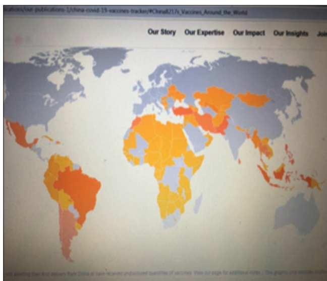
Figure 3: Chinese vaccine sales and donations around the world