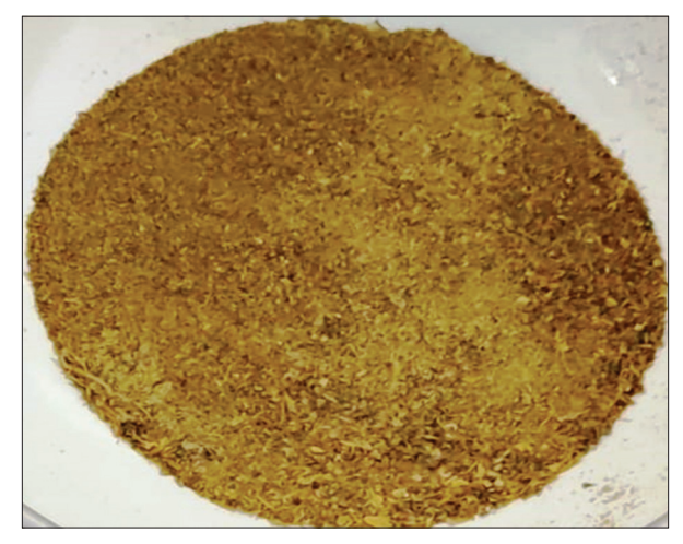
Figure 1: Powder of Amla (Emblica officinalis)

Red lentils provide a variety of skin-beneficial properties. To begin with, it slows down the ageing process. That because red lentils are high in antioxidants, which aim to minimize