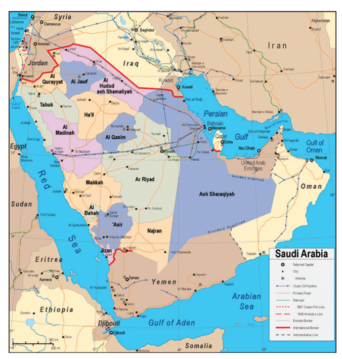
Figure 1: Map of Saudi Arabia

over 60. This data shows that the demand for health care is going to increase due to diseases caused by unhealthy lifestyles and non-communicable diseases (2020).<sup>[5]</sup> A report from a household survey by the General Authority for statistics conducted in 2018 reported a definite increase in non-communicable diseases and chronic diseases (2021). The World Health Organization (WHO) estimated that noncommunicable diseases are responsible for the deaths of over 41 million people each year, equivalent to 71% of all deaths globally. Most of these deaths are caused by cardiovascular diseases, which kill 17.9 million people annually, followed by cancer (9.3 million), respiratory diseases (4.1 million), and diabetes (1.5 million).<sup>[6]</sup> National statistics retrieved from the Saudi Arabian government report the same statistics for common diseases that lead to death in the Kingdom. According to Tyrovolas et al. (2020), the main causes of death were reported to be ischemic heart disease, stroke, and road injuries. Depression was the leading cause of disability in females, and road injuries were the leading cause in males. High body mass index (BMI) has been reported to be a major risk factor for disease burden among the Saudi population.<sup>[7]</sup>